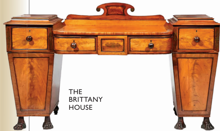
THE BRITTANY HOUSE