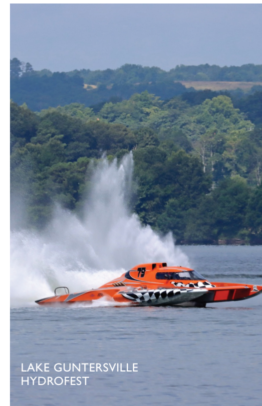
LAKE GUNTERSVILLE HYDROFEST

Voted the #1 public golf facility in America by the readers of GolfWorld , Robert Trent Jones, Sr. is on record saying that Grand National was the single greatest natural site for golf he had ever seen. The course is built on 600-acre Lake Saughatchee with 32 of the 54 holes draped along its filigreed shores.