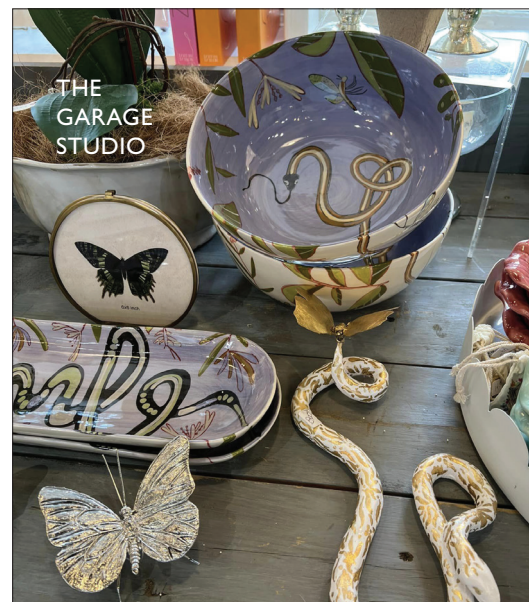
THE GARAGE STUDIO

A creative studio for artists and a colorful, fun gallery full of unique one of a kind pieces. Located on Scenic Highway 98, shop original art, clothing, spa products, interiors and accessories.